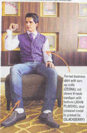
Formal business shirt with turn up cuffs (ZEONA), cut sleeve V-neck cardigan with buttons (JOHN PLAYERS), dual coloured metallic printed tie (BLACKBERRY)